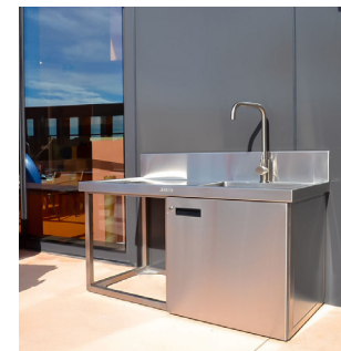
(L-R): Top - A view of North Melbourne Primary School, Britex Pattern Trough No.3, Britex Dado Double Round Drinking Fountain with Hands-Free Bottle Filler, Britex Laboratory Bowls with Laboratory Set 01, Britex Pattern Trough No. 3 and Britex Custom Single Sink Bench.